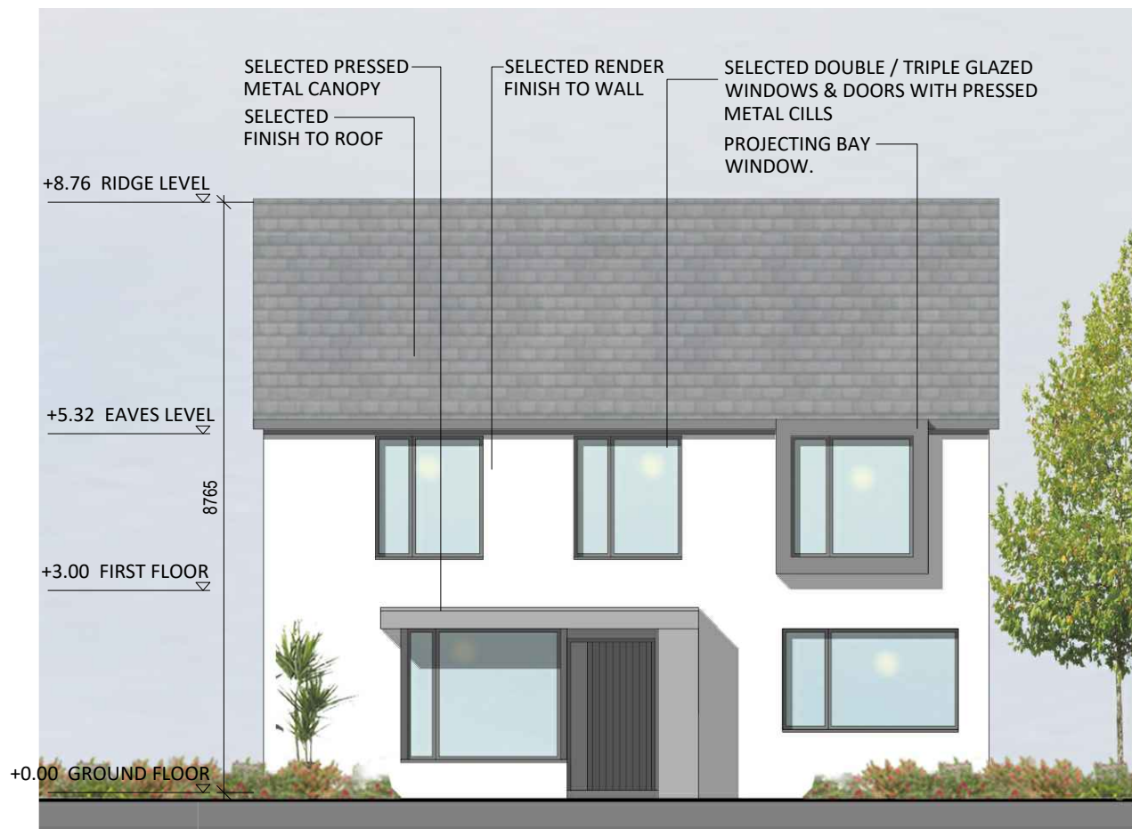
FRONT ELEVATION scale 1:100